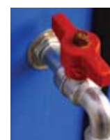
Page 3 Water conservation tips