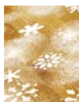
Page 2 Four seasons