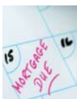
Page 2 Interest rates

The maximum number of interest free days commences on the day after a statement has issued, most commonly this is the end of a continued on next page